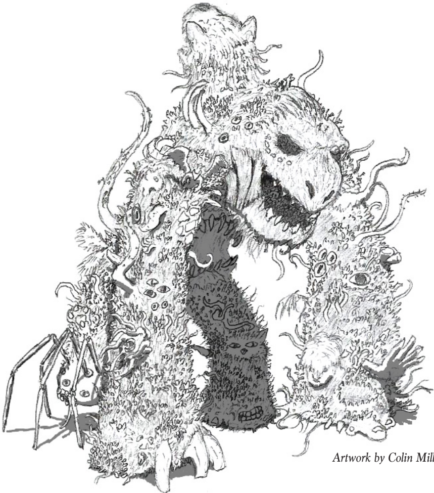
Artwork by Colin Mills

The caster creates a 100' radius zone of madness, provoking all living creatures within to a mindless frenzy. The zone is centered on the caster, moves with them, and lasts for a number of rounds equal to the CL. Each round, creatures within the zone must attack the nearest living creature with either their natural attacks or the Blood Fang of Culmenthdor. Affected creatures also gain +2 to their attack and damage rolls, and an extra attack that is -1d than their lowest action die. If an affected creature kills another creature, they must spend the remainder of the spell's duration consuming the body of the fallen.