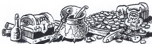
Table VI.i: Raider Treasure

A longship's treasure depends on its crew and their success as raiders. Judges should consult the following table for chance guidelines, and adjust accordingly. New items are noted below.